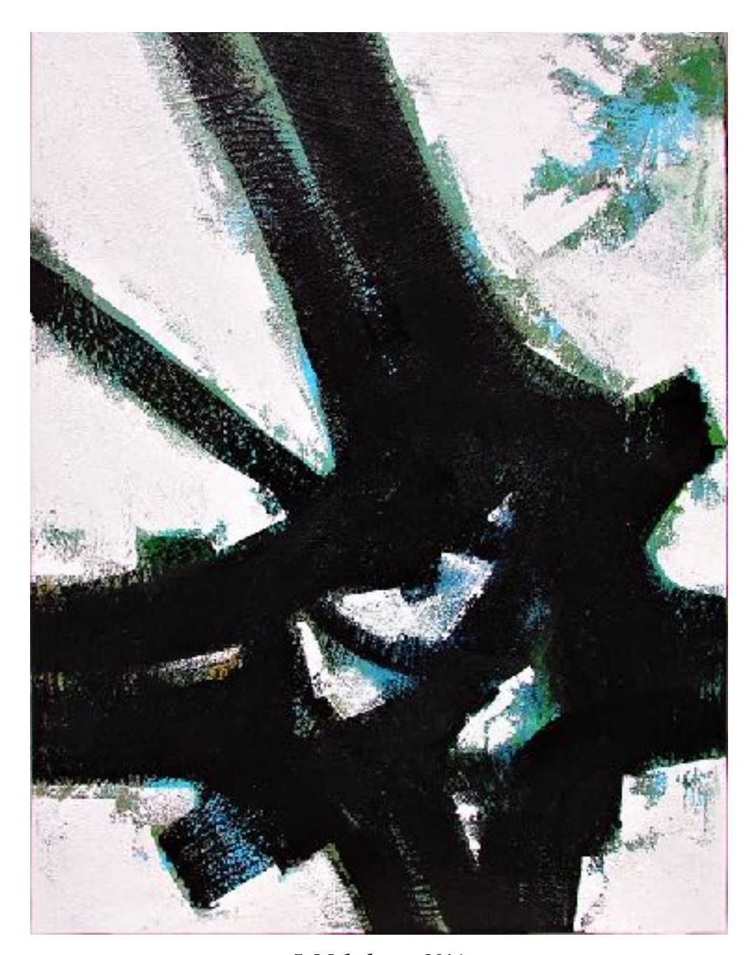
5. Makalatte , 2014 Acrylic and sand on canvas 36x48