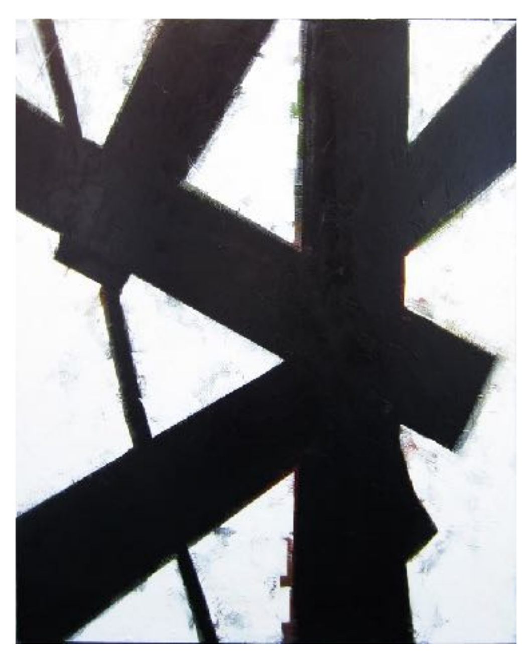
4. Contara , 2012 Acrylic on canvas 60x72