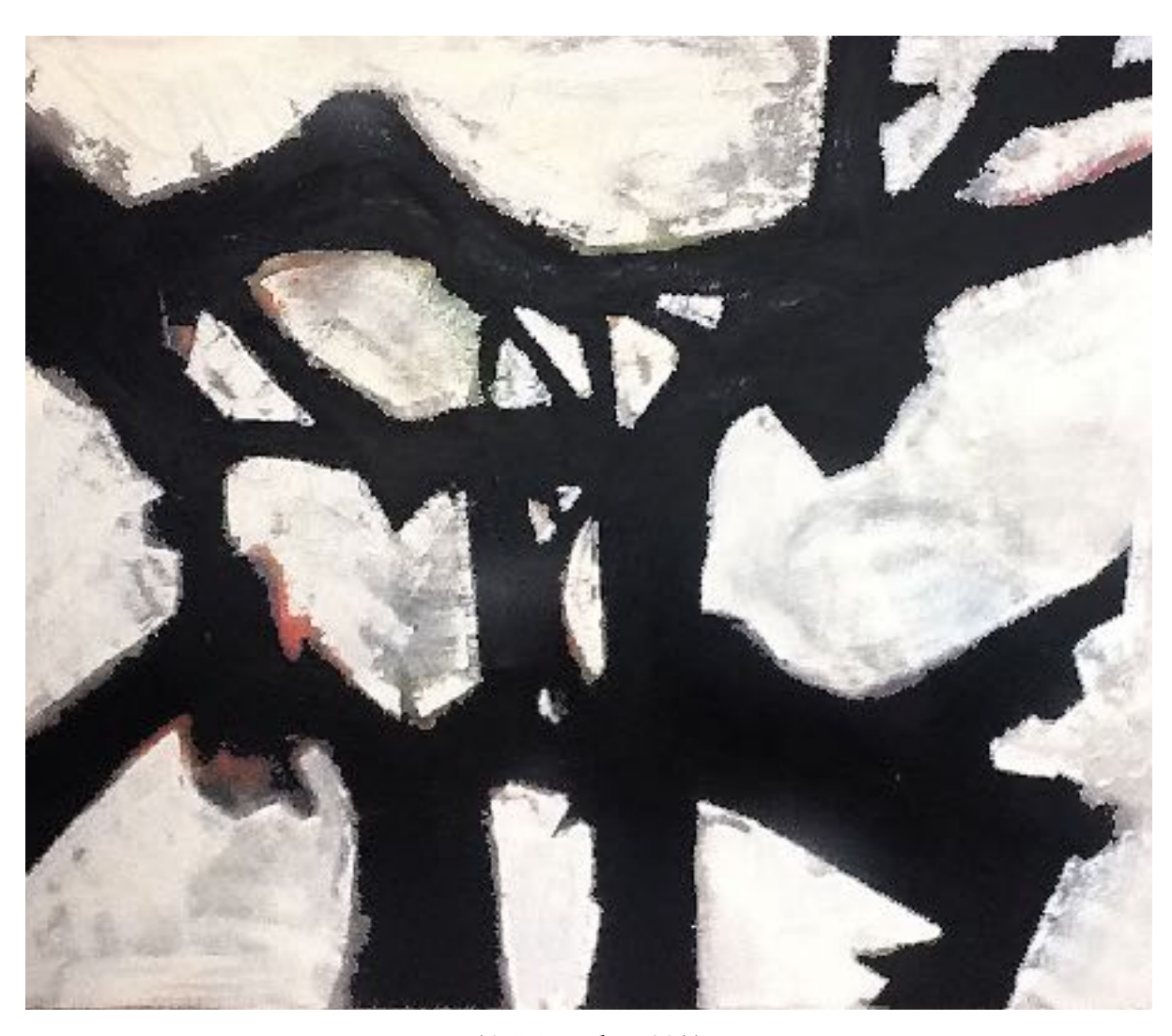
10. Montaka , 2011 Acrylic and sand on canvas 48x60