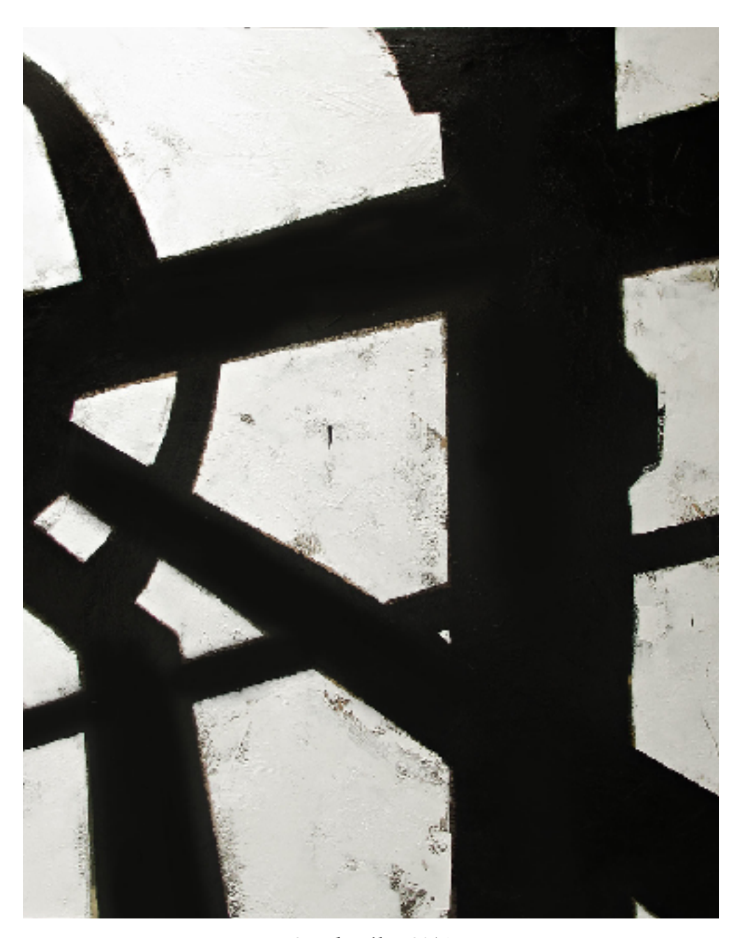
2. Telemika, 2014 Acrylic and sand on canvas, 60x72