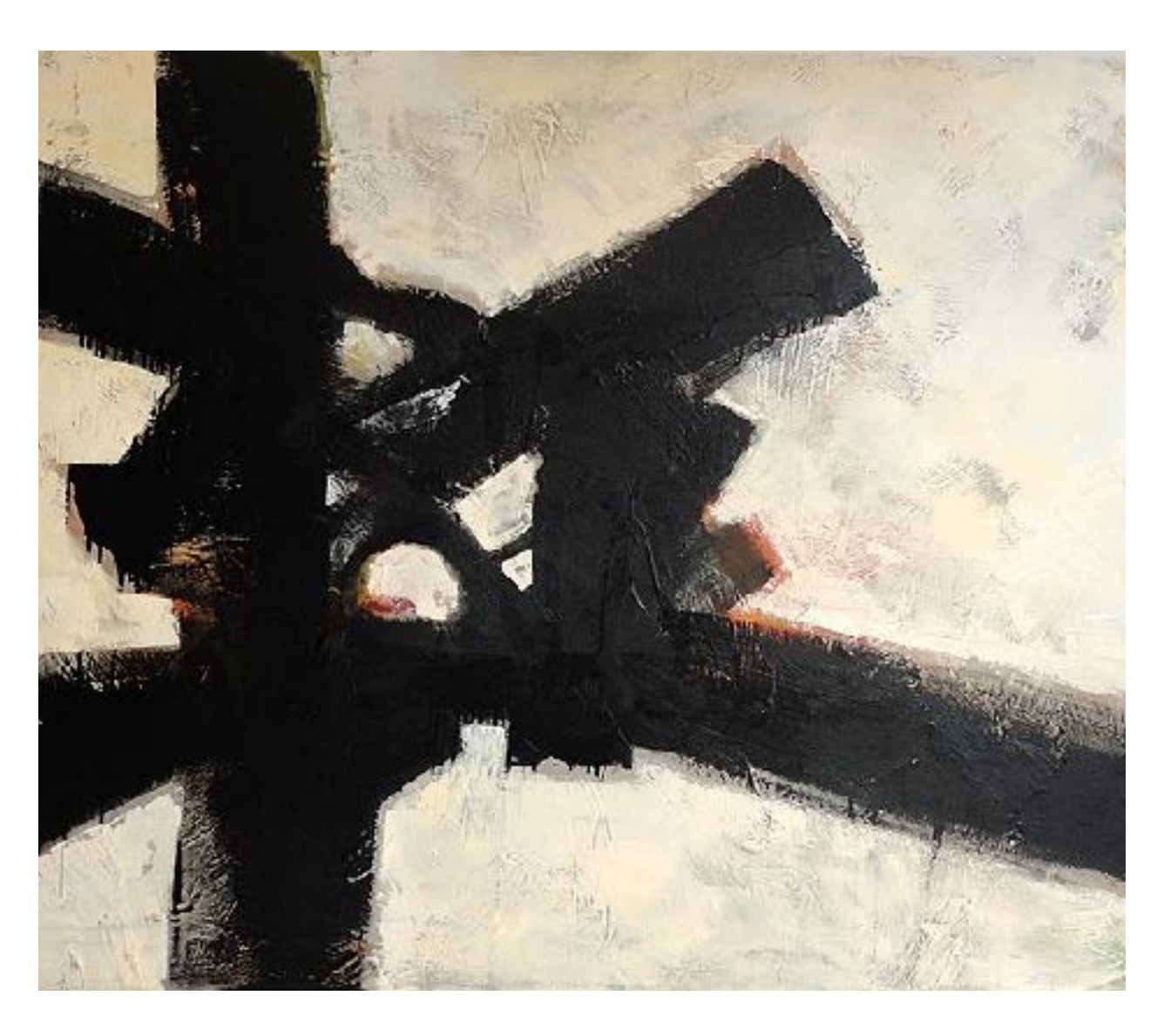
9. Terra Firma , 2011 Acrylic and sand on canvas 48x60