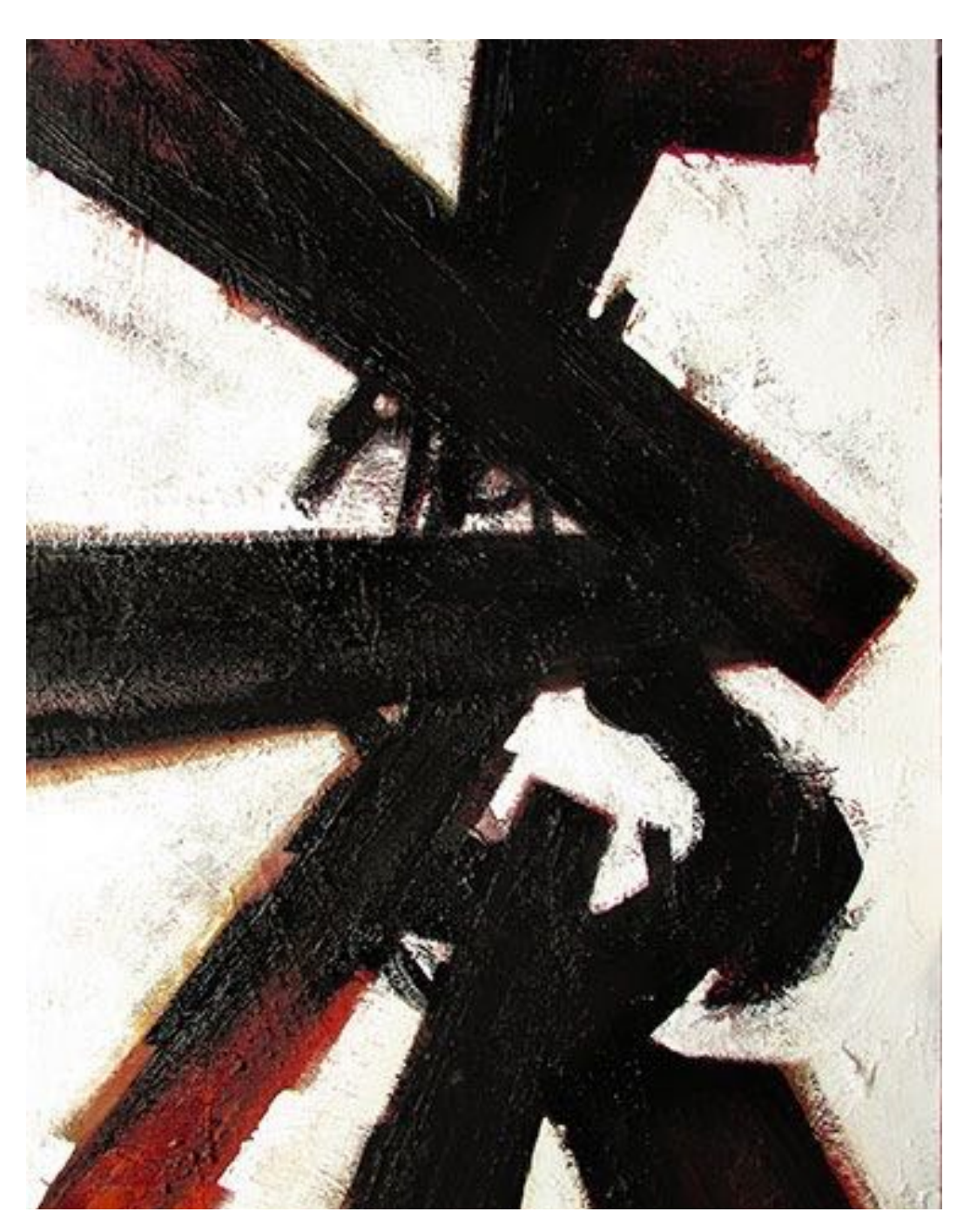
8. Snap 5 , 2014 Acrylic and sand on canvas 48x72