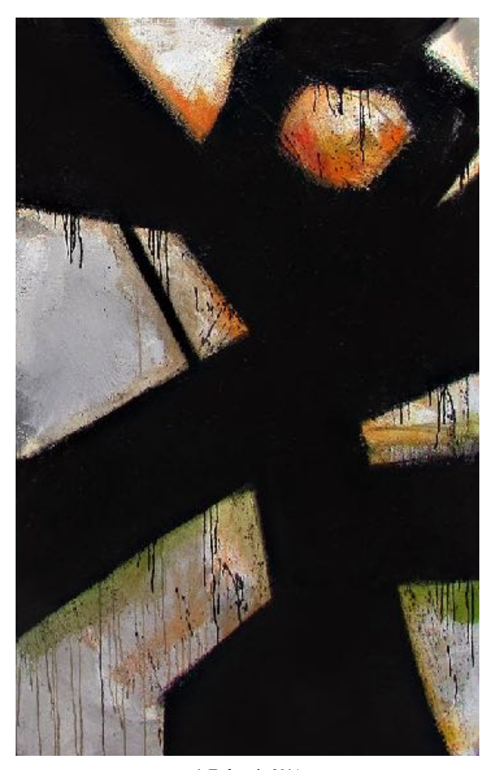
6. Dakami, 2014 Acrylic and sand on canvas 48x72