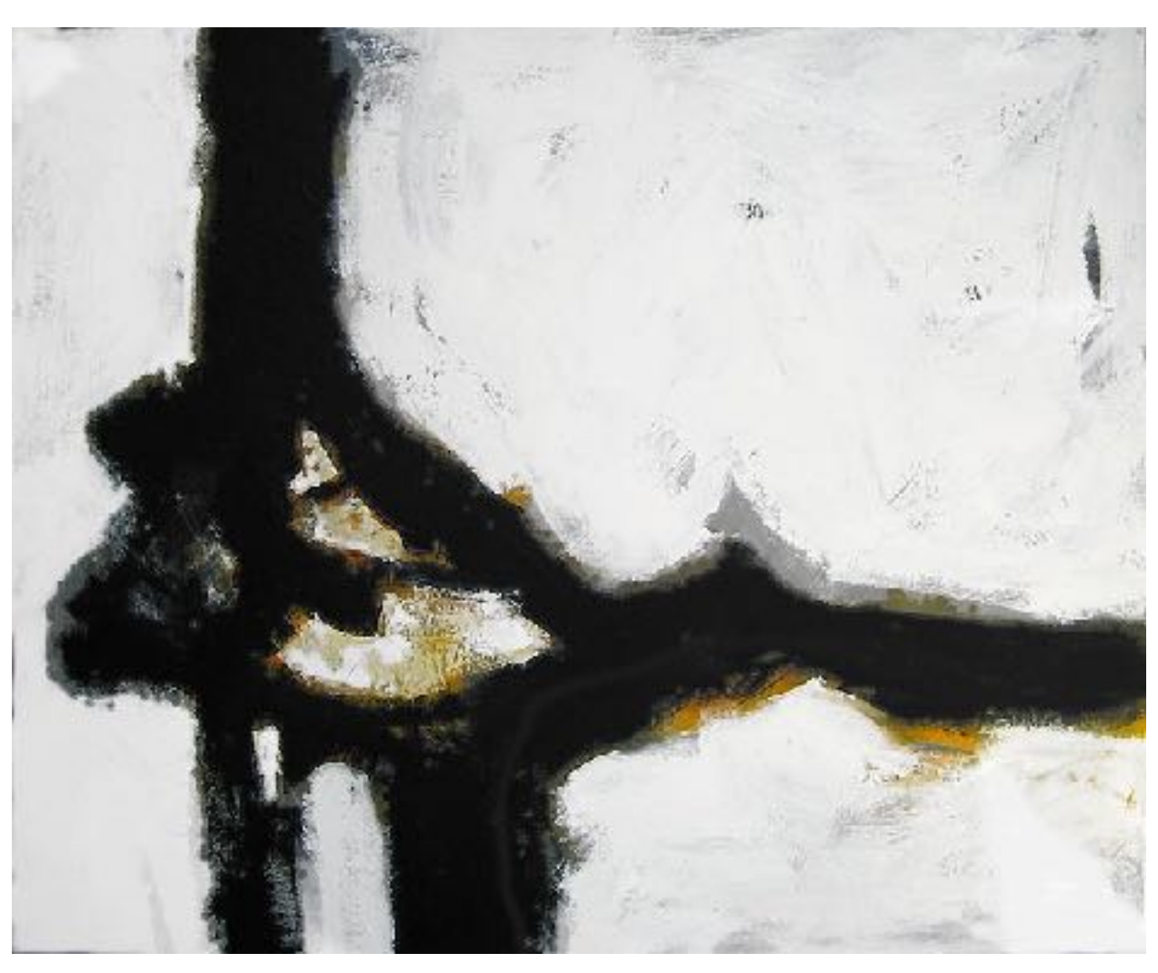
3. Terra Mata , 2013 Acrylic on canvas 48x60