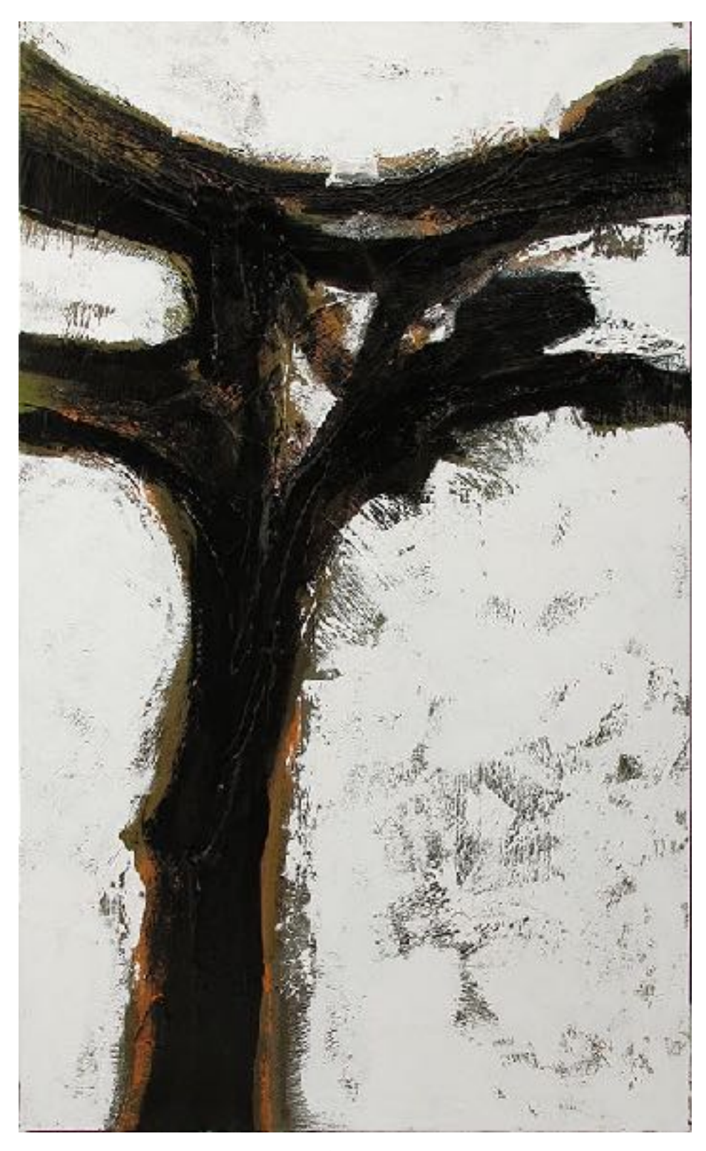
7. Akuta 2014 Acrylic and sand on canvas 36x60